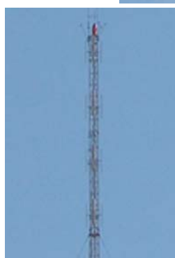
PSI ANTENNA MOUNTED ON THE TOWER.

Corporate Office P.O. Box 113 719 Pensacola Road Ebensburg, PA 15931